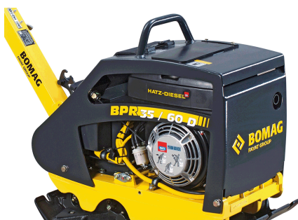
Robust and reliable Best component protection